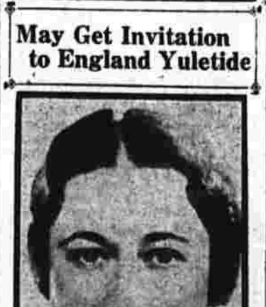
Duchess of Windsor

Beckworth, a former school teacher, unmarried, 29-year-old farmer, a veteran of 18 years in the House, in the Democratic primary election today to indicate that foreign trade, upon which the New Congress and the young House members were having a falling out.